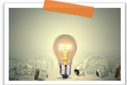
a light bulb